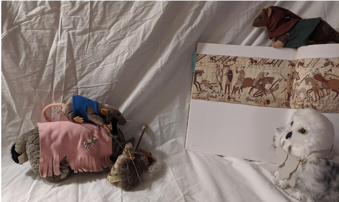
The death of Harold scene from the Bayeux Tapestry, re-enacted by War Unicorn (as the horse), Rat (as the Norman warrior), and Pika (as King Harold)