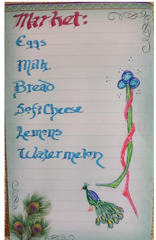
A finely calligraphed shopping list (SMASH Challenge #6)

13. When Royals get together, they like to show off examples of their kingdoms' artisans and artists, by exchanging gifts. They like to honour their own subjects with little gifts and lauds, as well. But these little tokens of respect and gratitude come from all of us! Make five pieces of largesse, to donate to your local branch or kingdom, and