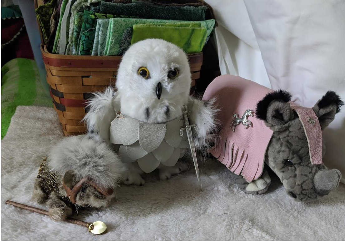
Armored and armed plushies, ready to defend the household (and the fabric stash) (SMASH Challenge #2)

6. Calligraph your shopping list. Share a photo of it, here. Bonus points for illumination! 28 points Alison Wodehale -Done! 33pts nice.