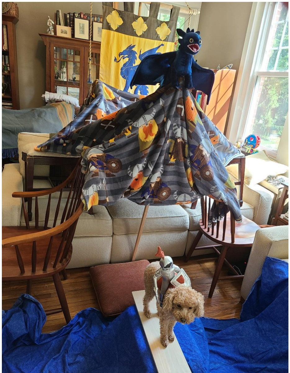
A most elaborate blanket fort.

47. Journal for two days about your modern life but as if your persona was living it. (Like if you go to the grocery store, your persona talks about going to market). Post in the comments. 37 points Kandy Done and posted Received 60pts!! Woo-hoo! Wow